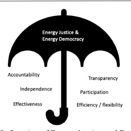
Figure 1. Umbrella function of Energy Justice and Energy Democracy.

The principles mentioned in Figure 1 are described below, which are common to both the ED and EJ concepts.